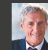
Philippe Saurel Mayor, City of Montpellier President of Montpellier Méditerranée Métropole

The Smart City thus reinforces innovation momentum, notably with respect to adapting to climate change, and actively contributes to sustainable economic development for our territory.